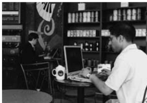
Second Cup café at 1550 Kingston Rd.

R.E.T.'s vision is to be the premier Wankel Rotary Engine manufacturing company in North America. It is located in a 10,000-square-foot facility at 817 Brock Rd. S., Units 7 and 8, and will benefit from Pickering's proximity to Toronto. Call 905.420.5757, visit www.rotaryengines.ca or email info@rotaryengines.ca to learn more.