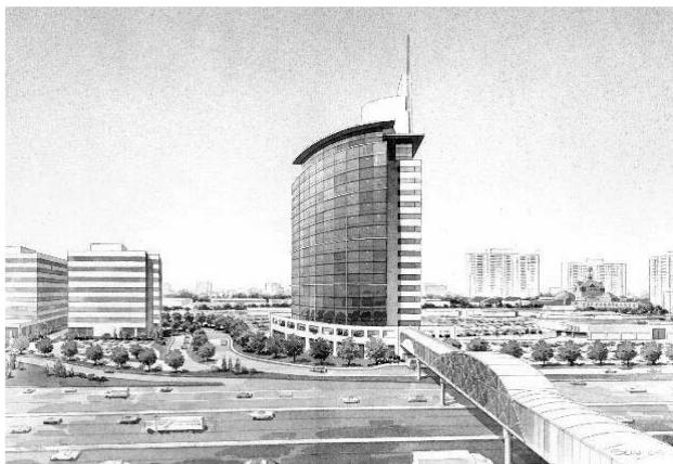
Conceptual rendering of office tower in City Centre.