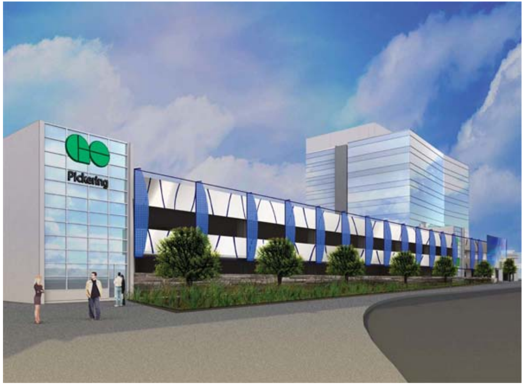
(Above) Architectural rendering of the new GO Parking structure – west elevation - adjacent to new office tower on Pickering Town Centre lands. Both projects now under construction.