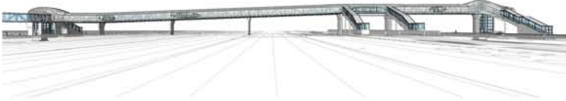
401 LOOKING EAST