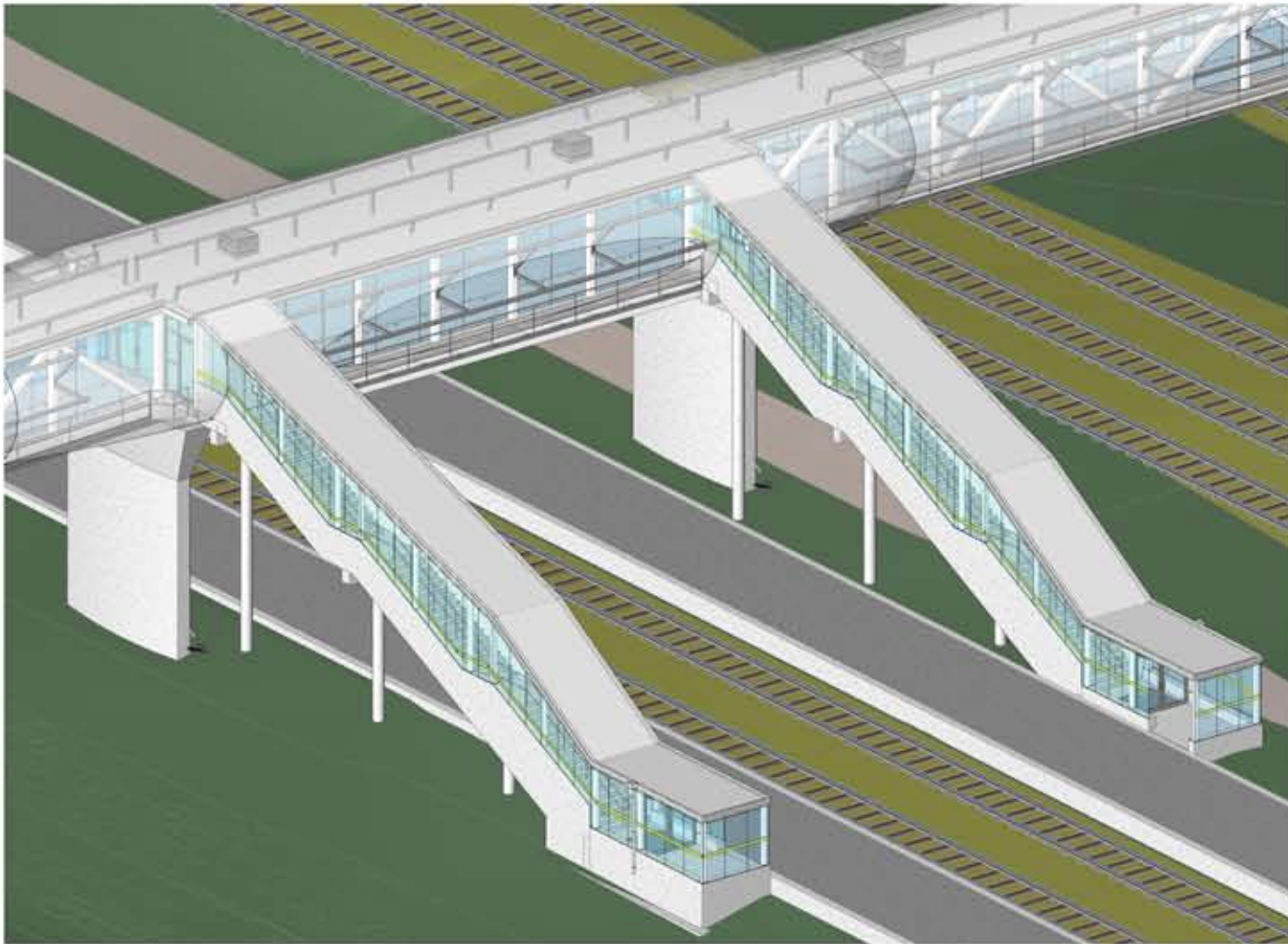
GO STAIRS & PLATFORM