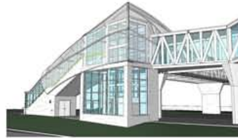
NORTH TERMINAL LOOKING S/E