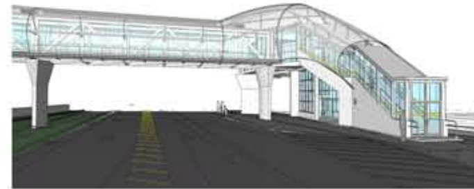
NORTH TERMINAL LOOKING WEST